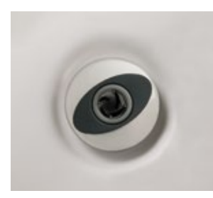
FX Small Jet